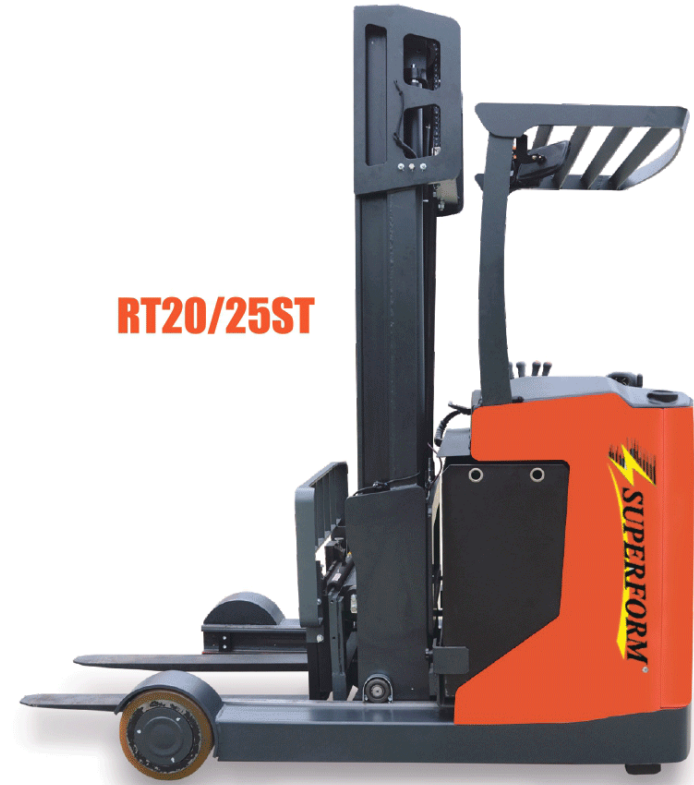
Reach Truck/Tow Tractor