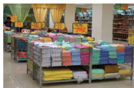
Half Netting Offer Bin display at supermarket.