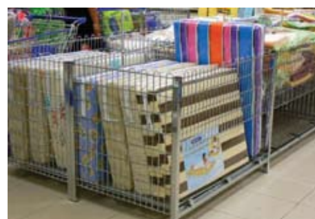
Full Netting Offer Bin for promotional display.

* Other finishings (epoxy powder coating or nickel chrome plating) available.